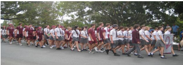
Anzac Day 2012

Students are to assemble on Alma Street between Cambridge and Archer Streets (behind Target) at 9.30am. Please wear your school uniform and hat, apply sunscreen and carry a water bottle. Students can be collected from the car park adjacent to the Heritage Hotel at roughly 11 am. If you need any further information please contact Mike Hinds at the school.